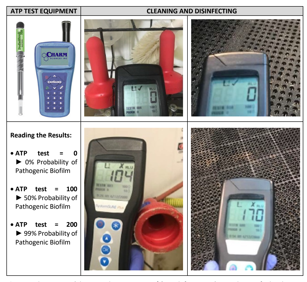
Figure 2. The ATP test (Charm reading equipment / & swab for testing) is used to verify the cleaning and disinfection of food contact surfaces, equipment, and tools. It provides a quantitative and objective measure of cleanliness and helps establish and maintain cleaning standards and protocols.

Mixing products could be dangerous and should be avoided. Follow proper guidelines with caution to ensure safety and effectiveness. Below are some examples and important points to be considered: